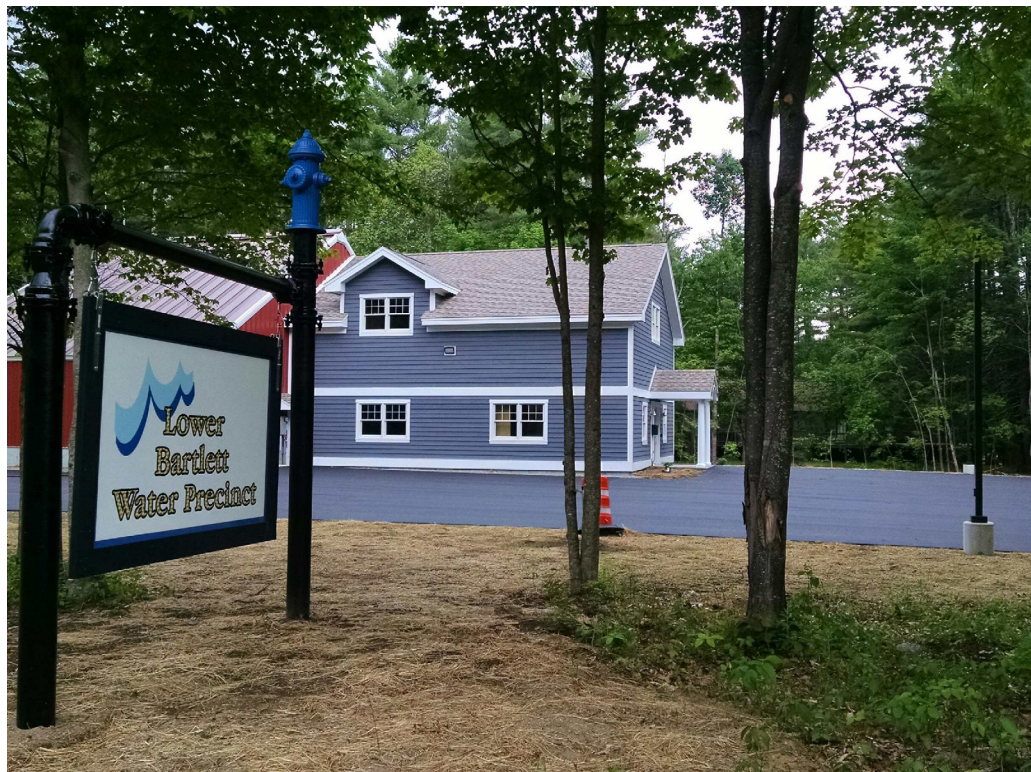
The LBWP is all moved into our New Facility Building, located at 367 NH RT 16/302, INTERVALE, NH 03845

MARKETING PRESORT AUTO N. CONWAY, NH 03860 PERMIT #160